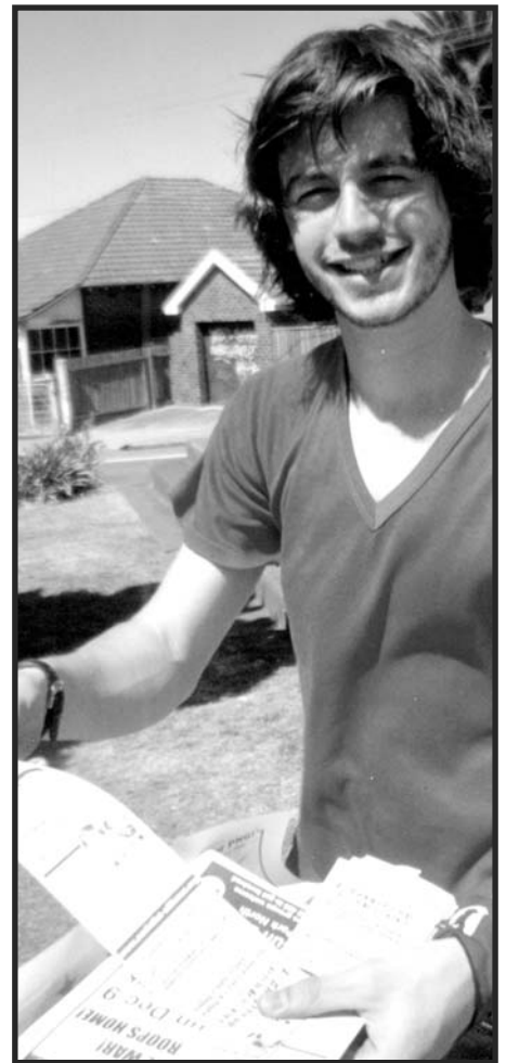
Polling day, Sydney 2001.

The next election may be the best chance yet to not only knock off the Howard government, but also for us to take another significant step forward in strengthening the Socialist Alliance, and broader left alliances with all those who want to transform parliament house into the people's house.