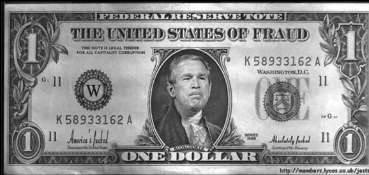
Unlike the US President, the Socialist Alliance depends on its members and supporters to fund projects and campaigns that provide an alternative voice.

Finally, as the Socialist Alliance becomes an increasingly important factor in Australian politics, it is becoming clear that