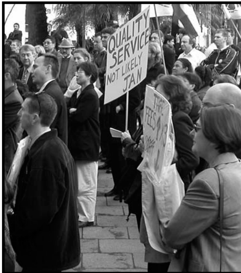
Protest against TAFE job cuts, July 3.

Of the 21 Socialist Alliance members in the NSW PSA that we know of so far, 15 are lead-