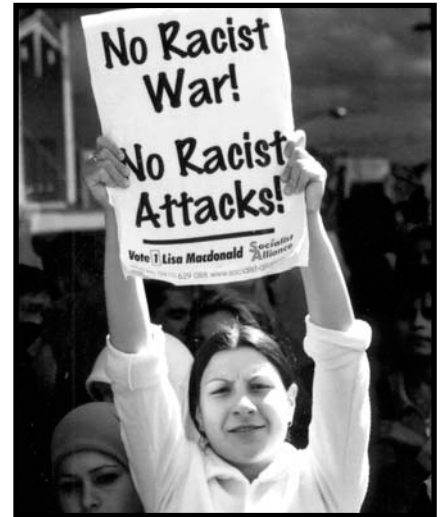
Auburn rally against war on Iraq.

The new branch is having fortnightly meetings at Toowong Library, and holding four public information and campaigning stalls each week. Amongst its immediate aims are to regularise letter-boxing and paste-ups in the area.