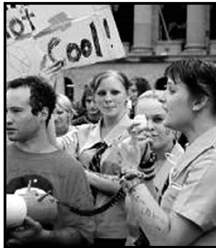
May 5 anti-war student strike, Brisbane.