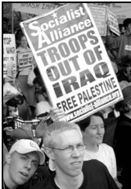
Canberra rally against Bush, October 23.

The protests everywhere - but particularly in Canberra, Sydney and Melbourne - were lively, colourful and broad. They were marked by a mix of generations and many new faces. Protesters included secondary students, office workers in their suits (some